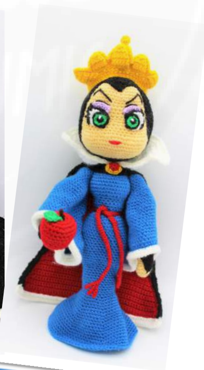
Evil Queen Pattern