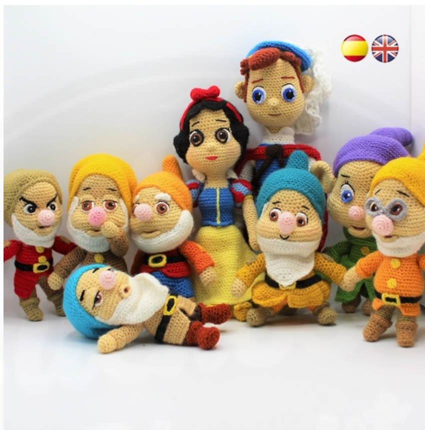
Snow White Collection (10 amigurumi patterns)

Did you like Sleepy? Here they are all smaller and with Snow White and the Prince