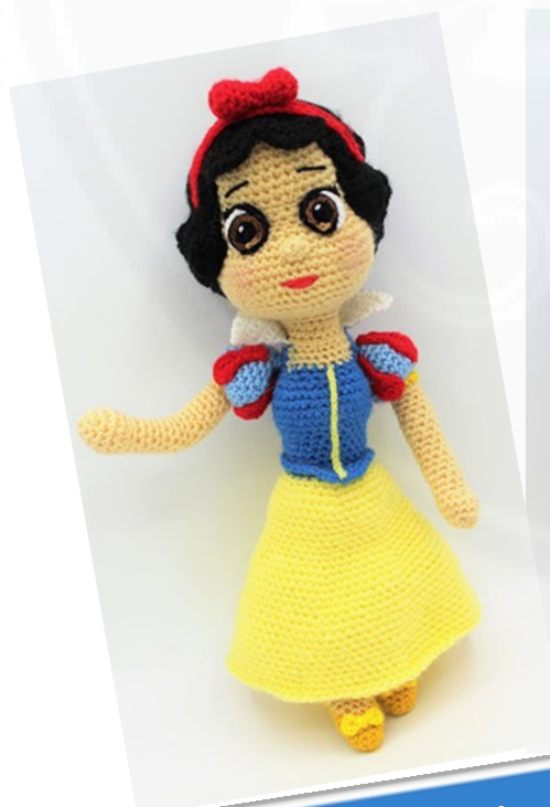
Snow White pattern